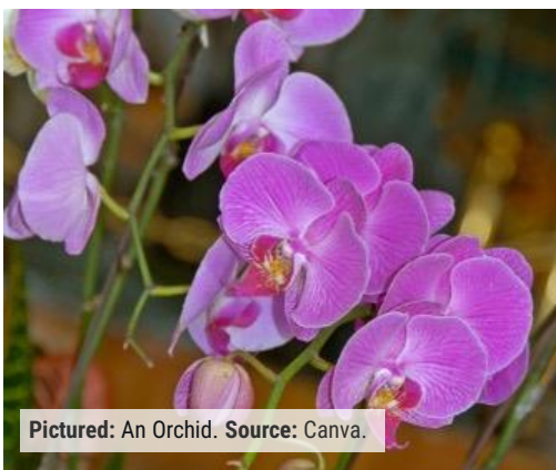
Pictured: An Orchid.