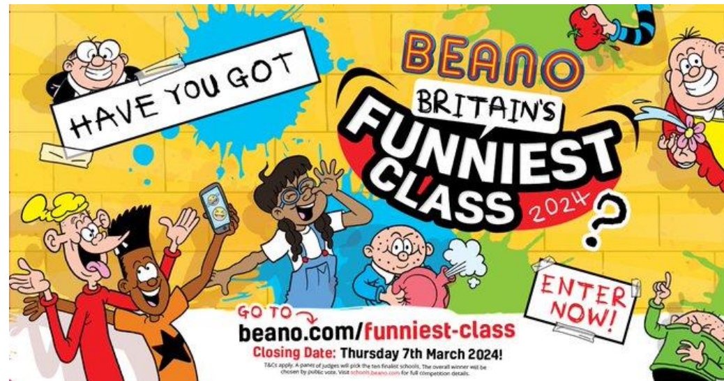
Pictured: How to apply to be named Beano Britain's funniest class.

Beano, the world's longest-running comic, has announced its search for Britain's funniest primary school class! The comic posted on X, 'Help Class 2B in their search for Britain's Funniest Class (and teacher)! 😊 As much as The Bash Street Kids love a bit of hard work (ha!), a little help wouldn't hurt... 🙏 If you think your students have the gift of the gag, enter now.' The well-loved children's comic is celebrating the Bash Street Kids' 70 th anniversary with the launch of 'Britain's Funniest Class 2024' competition. Teachers can submit their classes' hilarious gags and jokes via the website before the closing date on 7 th March. The most side-splitting entries will then be put to a public vote, resulting in one comical class being named the