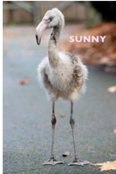
Pictured left: Flamingos. Pictured right: Sunny the flamingo chick.

Fast-thinking flight attendant, Amber May, received a unique request from one of the people on board the plane she was working on. The passenger, a zookeeper, had a very unusual problem and needed help building a nest! They were transporting rare flamingo eggs from Atlanta Zoo in Georgia, USA, to Woodland Park Zoo in Seattle, when their incubator broke. They asked the surprised flight attendant to help them keep the six eggs safe and warm. With hours of flight left to go, Amber came up with a plan – filling rubber gloves with warm water to keep the eggs at the correct temperature, which she refilled as the water inside cooled. Other travellers helped too, sharing their coats and scarves to keep the precious eggs insulated. The idea worked! All six eggs made it safely to