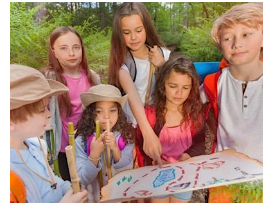
Pictured: Searching for treasure using a map and clues.

Would like to take part in one like this?