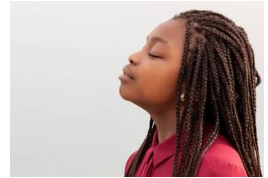
Pictured: Student practising their 'cyclic sighing'.

Did you know that breathing can help you feel better? There's a special breathing exercise called 'cyclic sighing' that can help lift your mood and lower anxiety. It's very easy to do! First, breathe in through your nose, filling your lungs, and then slowly let the air out through your mouth. Doctors say this simple exercise can make a big difference when you feel worried or stressed. Dr Emma White says, 'Taking deep breaths and letting them out slowly helps your body relax and feel calmer.' You can try