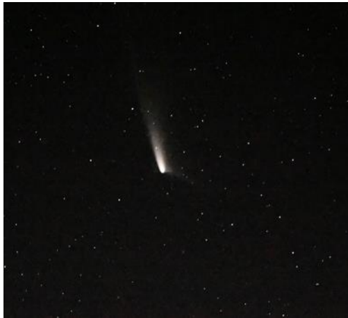
Pictured: Comet C/2023 A3 (Tsuchinshan-ATLAS) taken from the International Space Station.

The amazing A3 comet will be seen burning brightly across the sky this month! The Royal Greenwich Observatory are calling it 'the most impressive comet of the year!' Comet C/2023 A3 (Tsuchinshan-ATLAS) is predicted to be so bright, it will be visible to the naked eye. The best way to spot the A3 comet in the northern hemisphere is to look west just after