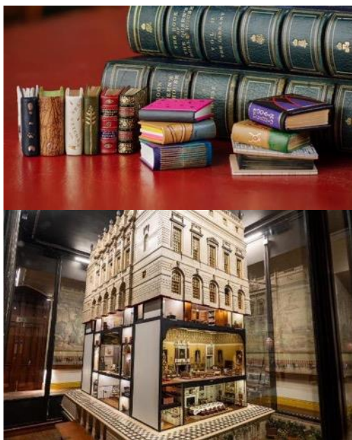
Pictured: Books from the new miniature book collection and Queen Mary's Doll's House.

Queen Mary's Doll's House is 100 years old this year! To celebrate, its library has been updated with a collection of miniature books written by some of today's most famous authors. The initiative, led by Queen Camilla, has created a modern-day miniature book collection within the doll house's library. Twenty authors, including Sir Tom Stoppard, Dame Jacqueline Wilson, Sir Ben Okri, Bernardine Evaristo and Julia Donaldson, contributed to the project by each producing a 4.5cm high mini handwritten book to add to the library. The Queen has even penned one herself! The books are on display, alongside the scaled-down replica of an Edwardian-style royal residence, at Windsor Castle throughout 2024. The doll house that was gifted to Queen Mary has electricity, running water and even working lifts. All the books in the original miniature library, around 175, are real books, handwritten by leading authors of the 1920s such as A.A. Milne, Sir Arthur Conan-Doyle and Vita Sackville-West. The Queen called the library, 'the most breath-taking space in the house', adding, 'These new books highlight the incredible richness of twenty-first