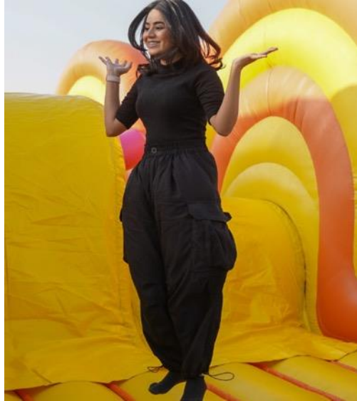
Pictured: Jumbo Jump in Karachi, Pakistan.

Have you ever bounced or played on a bouncy castle? Would you like to go on one this large?