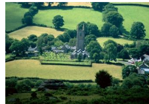
Pictured: A view over fields in Widcombe in the Moor, England.

hedges contain many different kinds of plants. Hedges also provide a home for many species of wildlife and aid in the fight against climate change. Furthermore, they can reduce air pollution and even improve soil quality! Do you know any other benefits of growing more hedges? Alternatively, can you think of any drawbacks?