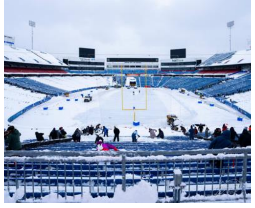
Pictured: American football fans work together to clear snow from the Highmark Stadium in Buffalo.

A huge snowstorm hit parts of the US over the Thanksgiving holiday weekend, with some places getting over three feet of snow! In Buffalo, New York, people grabbed shovels to help the Buffalo Bills American football team clear their stadium before a big game. Governor, Kathy Hochul, said, 'The snow is heavy, but New Yorkers are tougher!' Snowstorms like this are known as lake-effect snowfall: they happen when cold air blows over the Great Lakes. creating fluffy snow. Some areas can see up to six feet of