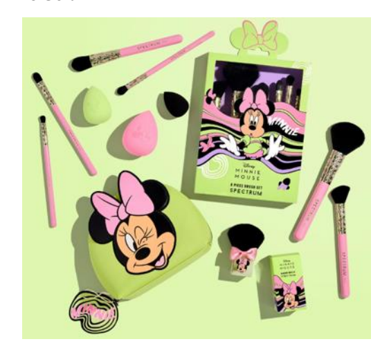
Pictured: Spectrum's Minnie Mouse collection.