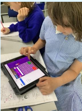
Using the iPad for practising times tables.

Through the PTA we would like to thank you as parents for providing enough money to buy an iPad for each class. We can now record and photograph our learning as well as being able to share this with you on Twitter. Without the support of our PTA we really would not be able to provide those special extras which our children deserve.