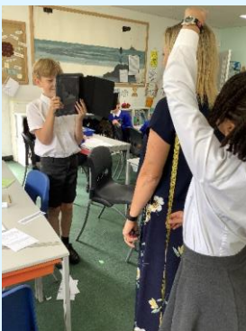
For recording measurements.