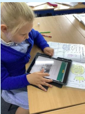
Finding facts about our Queen.