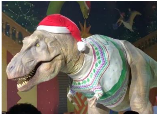
Pictured: T. rex flaunting his Christmas jumper!

Do you have a special jumper that you wear at Christmas time?