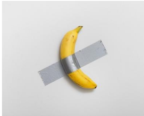
Pictured: Maurizio Cattelan's 'Comedian'.

A famous piece of art, featuring a banana taped to a wall, has been sold for almost five million pounds! The famous artwork by Italian artist, Maurizio Cattelan (created in 2019), is a fresh banana affixed to a wall with duct tape. Justin Sun, founder of cryptocurrency platform TRON, who bought the piece, said it, 'represents a cultural phenomenon that bridges the worlds of art, memes, and the cryptocurrency community.' Named the 'Comedian', what has actually been bought is a certificate of authenticity with detailed diagrams and instructions for its proper display. Justin added, 'In the coming days, I will personally eat the banana as part of this unique artistic experience, honouring its place