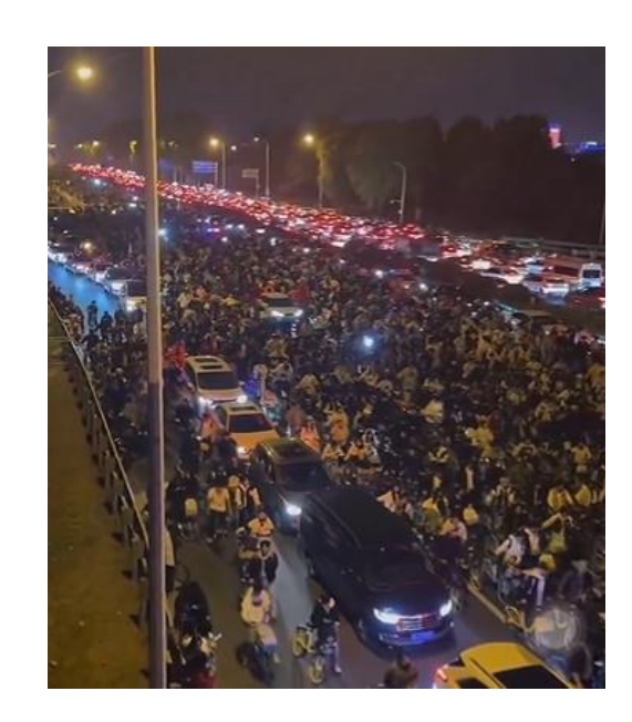
Pictured: Cyclists on their way to get their dumplings!

a second chance at youth, so you must go for a spontaneous trip with friends.' While it caused a bit of chaos, it was certainly an exciting adventure for everyone involved!