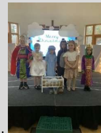
Devas and Bannerman Nativity.

Everyone enjoyed the Devas and Bannerman Nativity and the KS2 Christingle Service today. The children's singing is always so uplifting and the joy in their faces was clear to see. There were great performances by all and some extraordinary talents discovered as well. Thank you to our amazing children and the staff for orchestrating this Christmas delight.