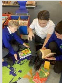
Visiting Coxheath Library.