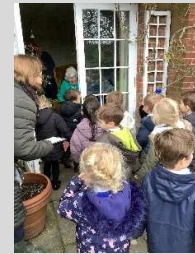
Devas singing to our local elderly residents at their homes and spreading Christmas joy.