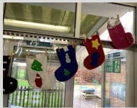
Design and Technology week – what a lot of designing and sewing across the school.